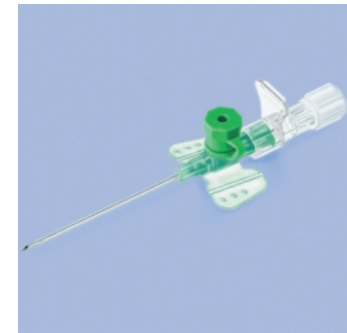
A comprehensive safety port-portfolio for intravenous access

Ecopin offers a tamper-proof closure of the injection port